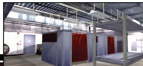
A virtual welding booth environment